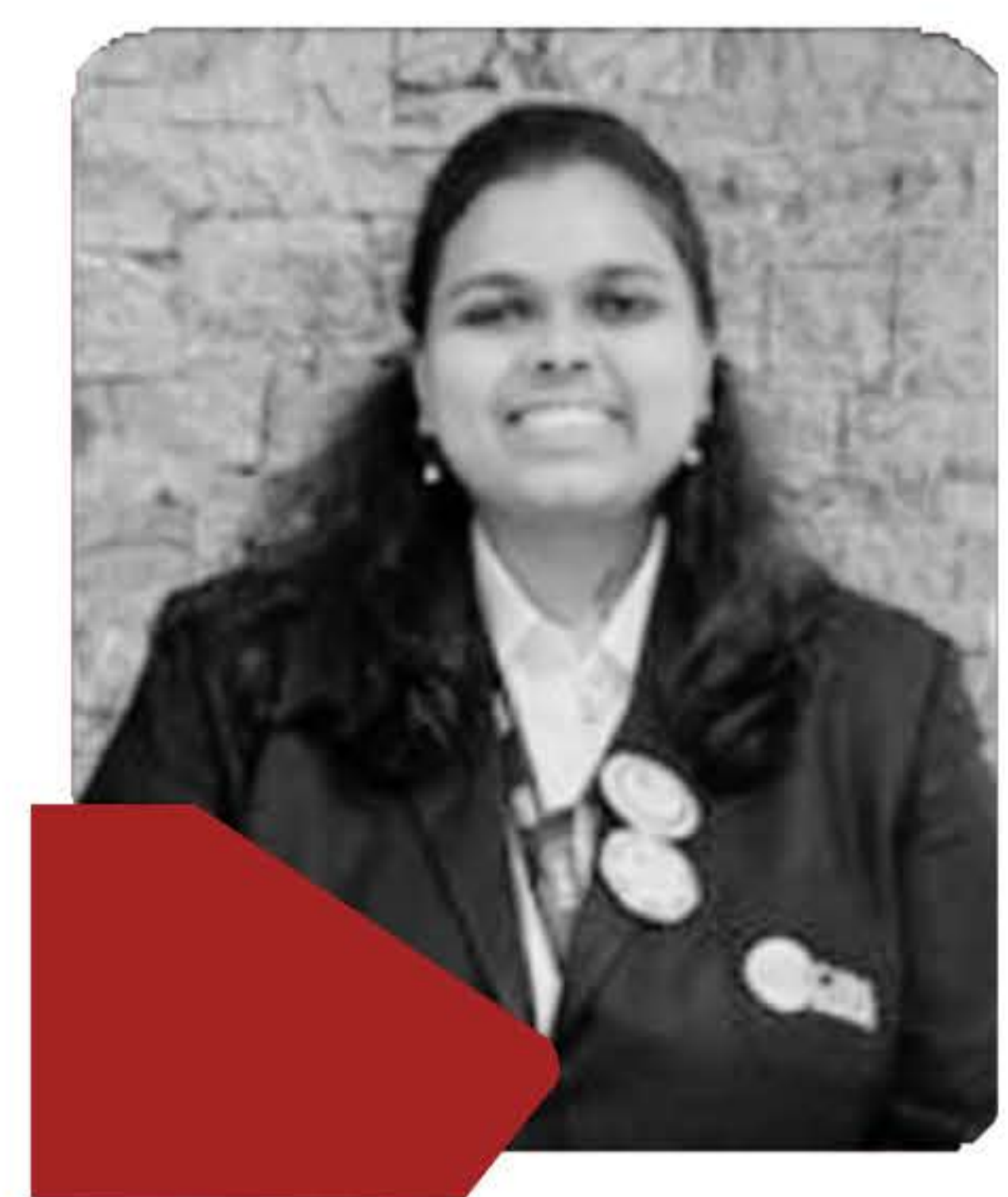
PULIMI MANASA PGDM Batch 2022-24